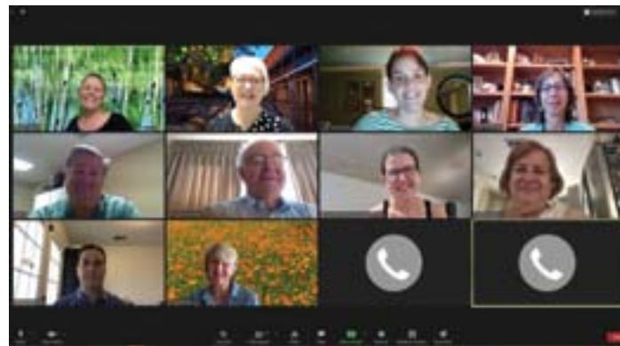
Zoom Executive Committee meeting 8/13/2020